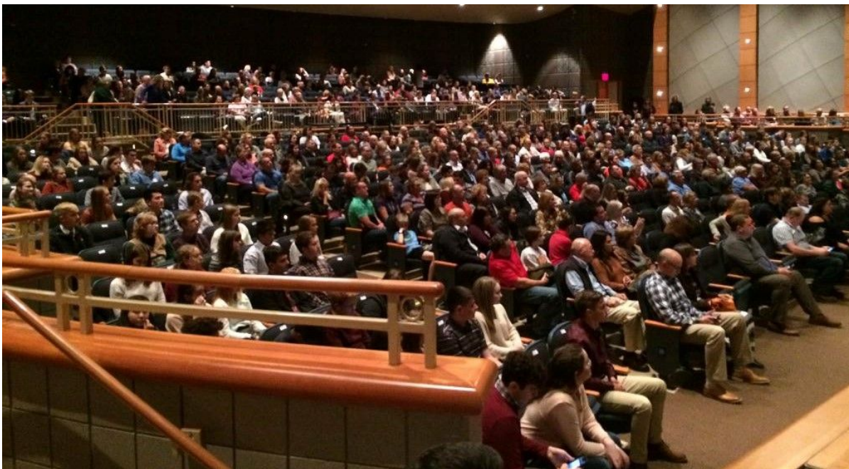
Medina Musical Bees

This is the first time the high school has made this presentation recognizing student academic achievement at these grade levels. This is a new tradition that will be carried forward annually and is a result of the District's current five-year strategic plan which was largely based on community feedback.